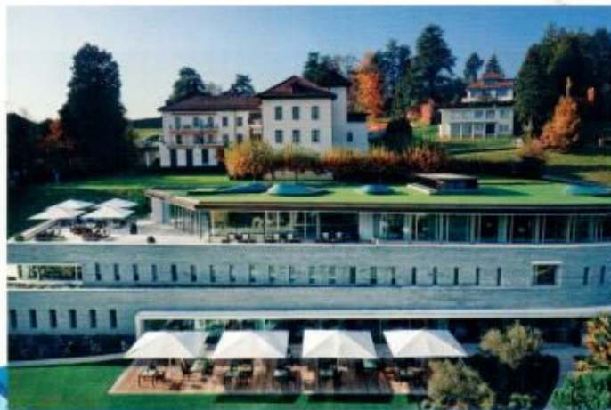
CLINIQUE LA PRAIRIE IN SWITZERLAND FEATURES SPRAWLING LAKE VIEWS AND GARDENS BELOW LEFT THE HYDROTHERAPY KNEIPP PATH